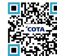
WEST BROAD STREET & SOUTH BELLE STREET COLUMBUS, OH 43215